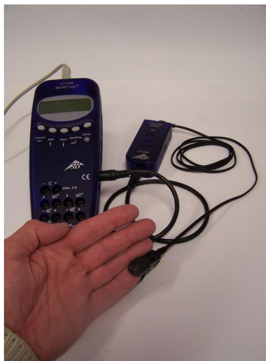
Fig. 1 Measurement of a person's pulse rate