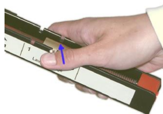
Fig. 1 Releasing the launch mechanism