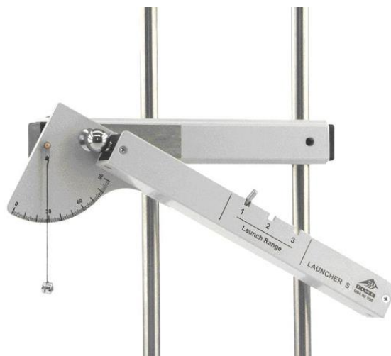
Fig. 2 Experiment set-up for oblique launching