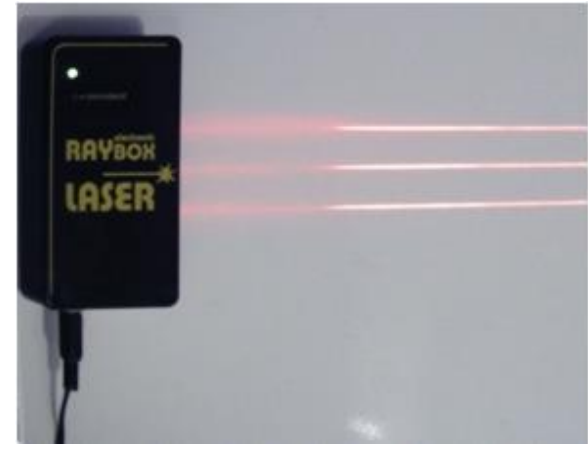
Fig. 2: Second laser mode