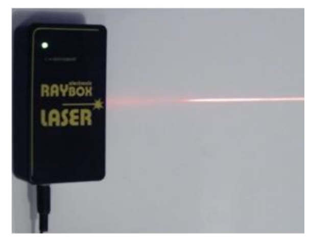
Fig. 4: Fourth laser mode