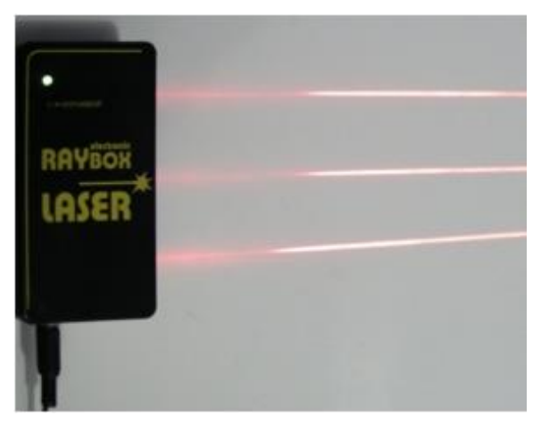
Fig. 3: Third laser mode