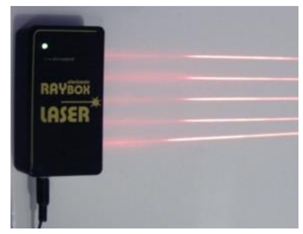
Fig. 1: First laser mode