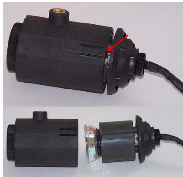
Fig. 1 Changing the bulb in the top light