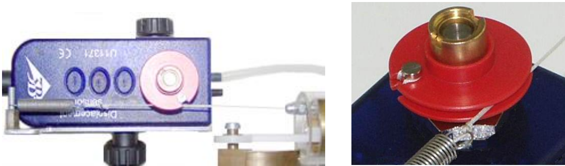
Fig. 2 Attachment of the thread to displacement sensor pulley