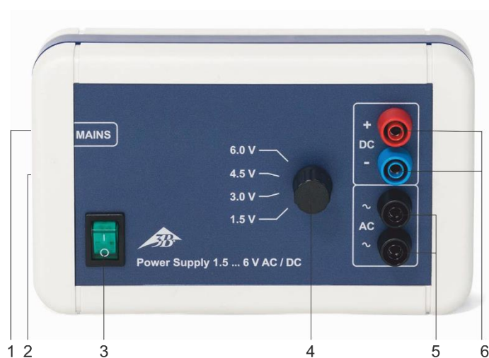
Fig. 1 Operating elements