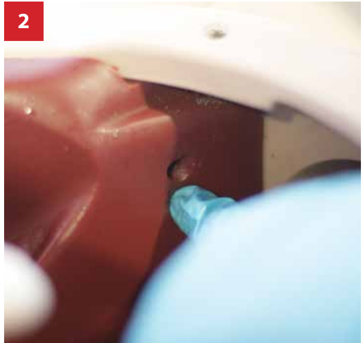
Locate hole in the abdomen.