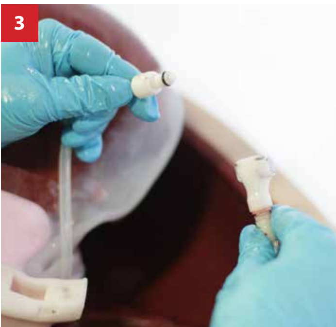
Pull the tube and connector out of the hole and connect to the fitting on the uterus