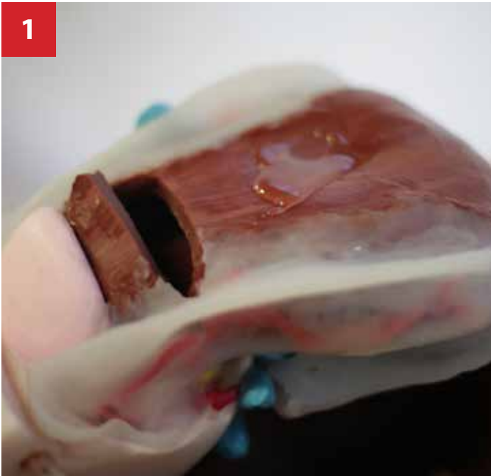
Lube uterus before inserting.