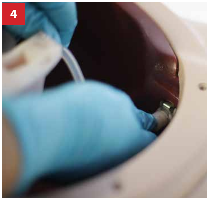
Once connected, apply lube to the tubing and feed the tubing and the connectors back through the hole.