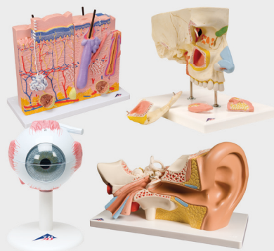
Anatomy Set Senses 8000847