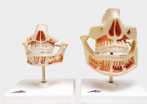
Milk Dentures 1001247 Adult Dentures 1001247