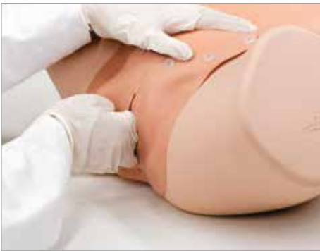
Perform bimanual examinations with palpable, realistic, normal and abnormal uteri

Using the new Gynecologic Skills Trainer P91 will provide invaluable experience on various gynecologic procedures: