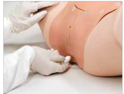
Suppository administration in the patent rectum