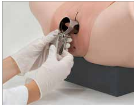
Perform vaginal examination with speculum