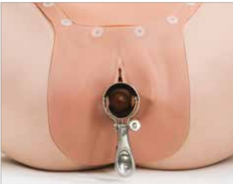
Train vaginal examination and visual recognition of normal and abnormal cervixes