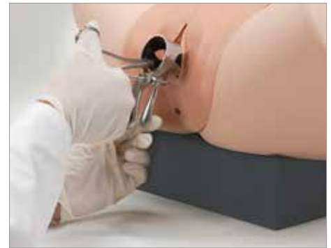
Practice use of tenaculum and Pap test procedure for cervical screening