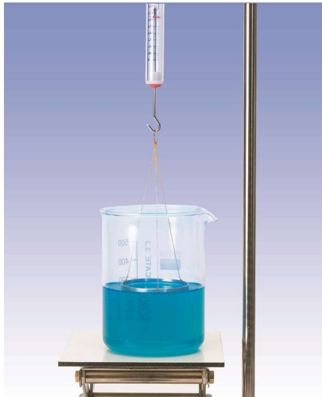
Fig. 3: Experiment set-up for surface tension measurements