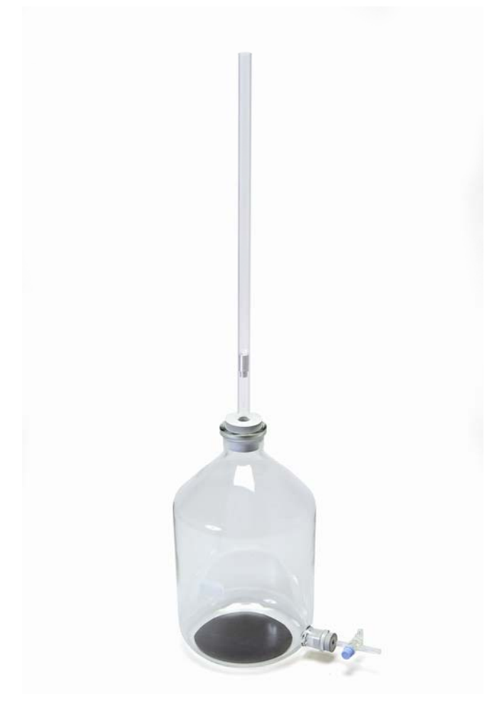
Fig. 2: Measurement set-up.

The experiment involves the use of a precision glass tube with a small cross-section A inserted vertically into the rubber stopper of a glass vessel with a large volume V. The piston is an aluminium cylinder of matching area and known mass m which can slide up and down the tube. The aluminium cylinder undergoes simple harmonic oscillation by bouncing on the cushion formed by the enclosed volume of air. The adiabatic exponent can be calculated from the period of oscillation of the aluminium cylinders.