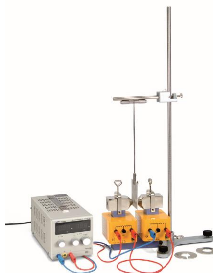
Fig. 2 Set-up Waltenhofen's pendulum