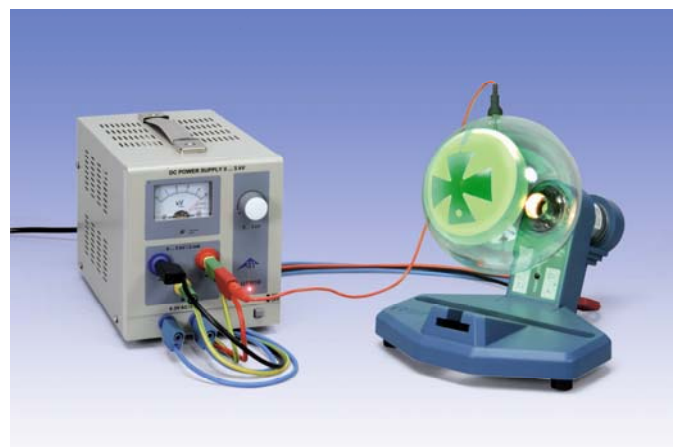
Fig. 2 Experiment set-up to demonstrate the straight-line propagation of electrons using a Maltese Cross tube